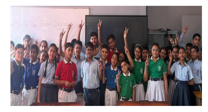
Class VIII "The Human Web" Activity:

The students of Class VIII B participated in "The Human Web" activity, where they passed a ball across their desks while sharing positive thoughts, happy memories, and uplifting experiences. As the ball was passed from one student to another, a web-like pattern emerged, symbolizing the connections, positivity, and sense of community within the group.